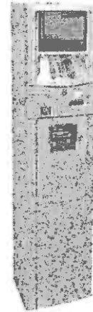
Fig 7: NP3 P, High end, stand alone