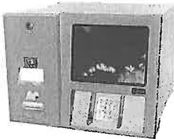
Fig 1: NC3 L, High end

Fig 6, 7, 8 and 9 are examples of configurations