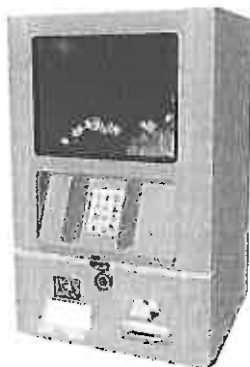
Fig 3: NC3 P, High end