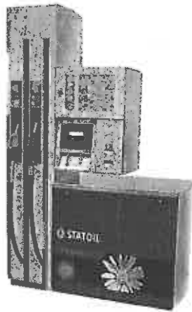
Fig 6: NC3 L, Mid range, Crind