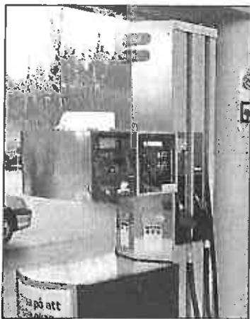
Fig 8: NC3 C Mid range Crind