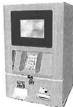
Fig 4: NC3 P, Mid range