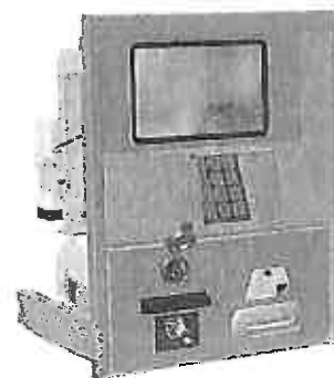
Fig 5: NC3 C, Mid range