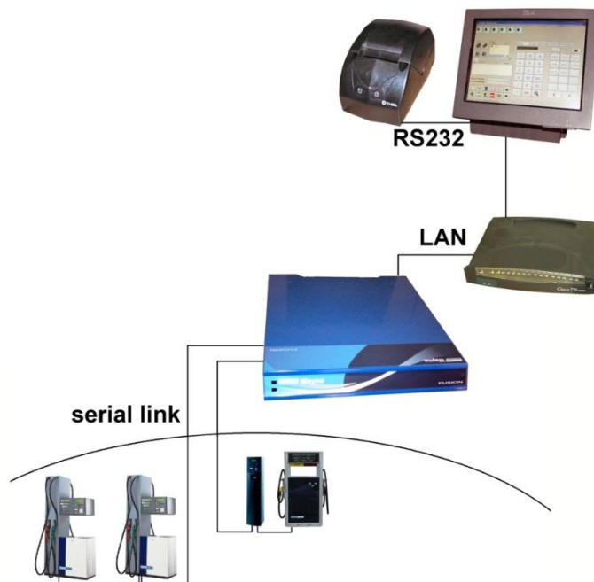
Figure 2: Typical configuration for Fusion forecourt system with external POS

Certificate no 10 70 29 edition 3. Date of issue: November 16, 2016