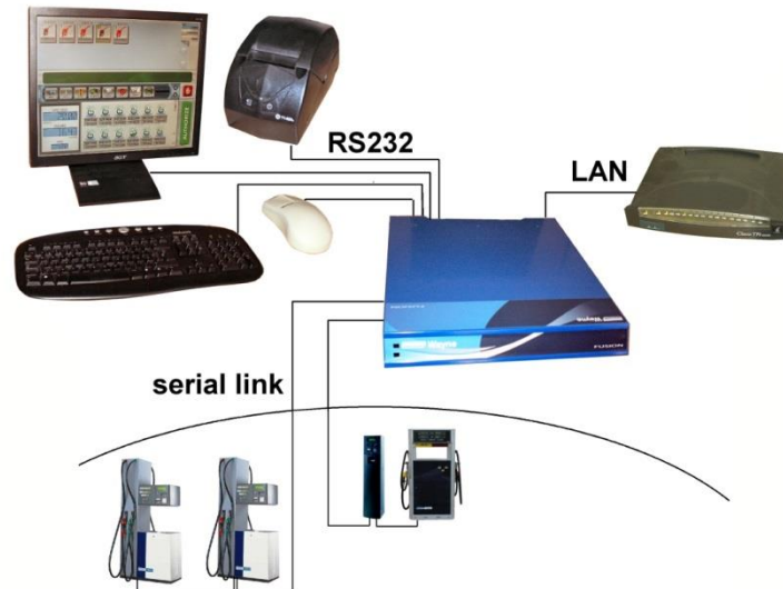
Picture 1: Typical configuration for Fusion forecourt system with embedded POS

Certificate for a part of a measuring system for LOTW No. 10 70 29 – Appendix