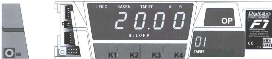
Figure 3: Figurer of the taximeter F1+ (CPU and display) with the lid (removed from the taximeter) for sealing the power supply, printer and communication cable, and also the connection for the black key.