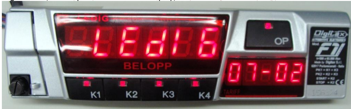
Figure 1: Digitax F1+ (Central Processor Unit (CPU) with display)

Digitax F1+ (Central processor unit with display)