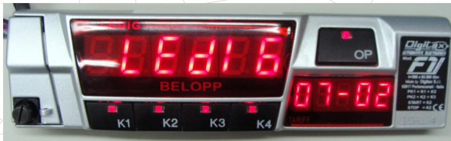
Figure 5: Placement of marking on F1+ and marking lable.