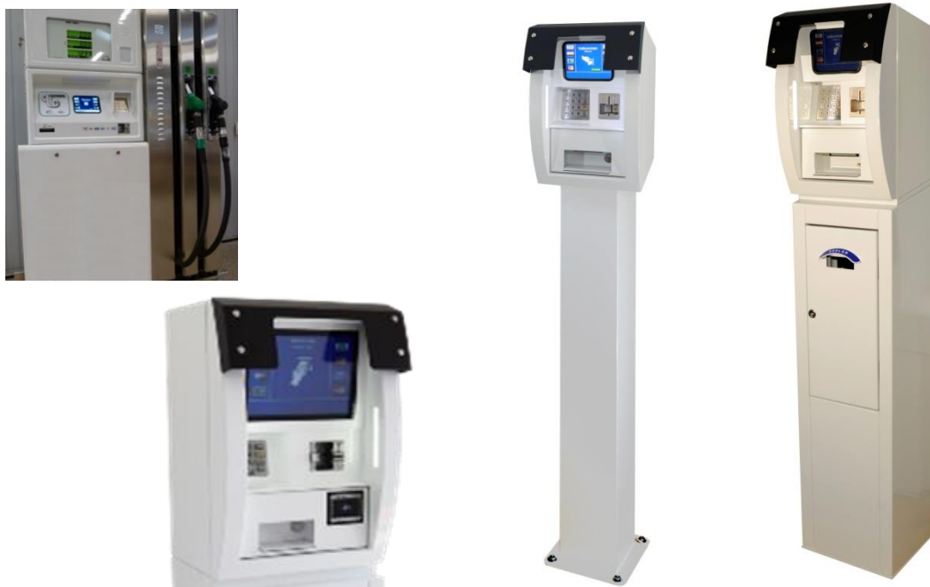
Picture 2: PaySys terminal, on a pump, alone, on a standard pillar and with banknote acceptor

The PaySys/LocSys terminal is normally delivered with a standard pillar. Furthermore it is possible to mount the PaySys/LocSys directly on a Pump (depending on the pump layout/design) or on a wall.