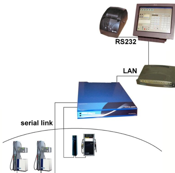
Figure 2: Typical configuration for Fusion forecourt system with external POS

This certificate may not be reproduced other than in full, except with the prior written approval by RISE Certification.