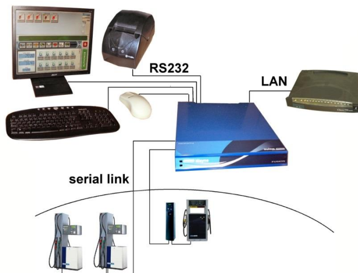
Picture 1: Typical configuration for Fusion forecourt system with embedded POS